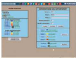
UGVLOG+

UGVLOG+ is necessary for managing the Key. With the Key Encoder, ENCODUSB, the programming is transfer into the Key