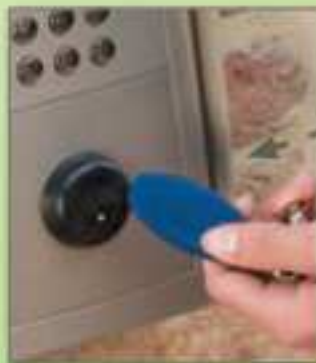
Key tag on the UGVBT Reader

When the Key is read by The Central Reader, The Name is automatically registered on the dialing list