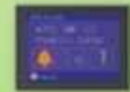
On the GTDMV Screen