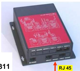
RJ 45 8-pin